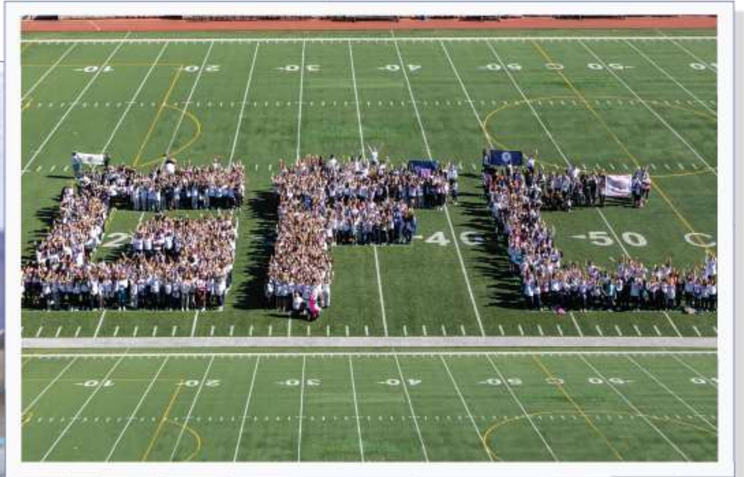
2022 Girls for the Cure Student GFC photo!