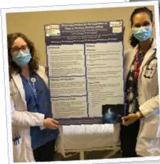
Music intervention for the facilitation of sleep in the acute geriatric setting